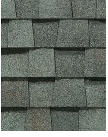
Max Def Colonial Slate