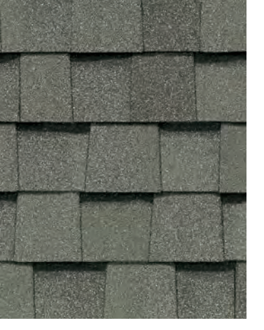
Max Def Cobblestone Gray