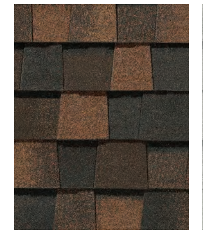
Max Def Burnt Sienna