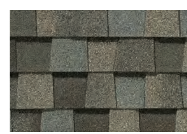
Max Def Weathered Wood