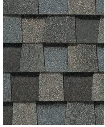
Max Def Weathered Wood