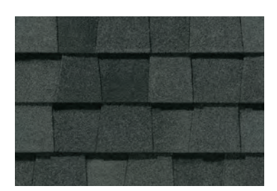
Max Def Moire Black