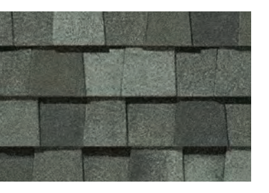
Max Def Granite Gray