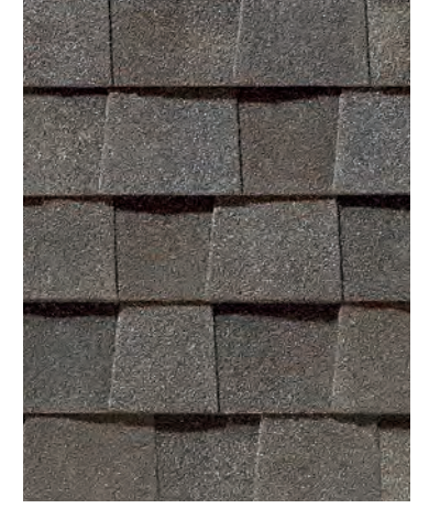
Max Def Driftwood