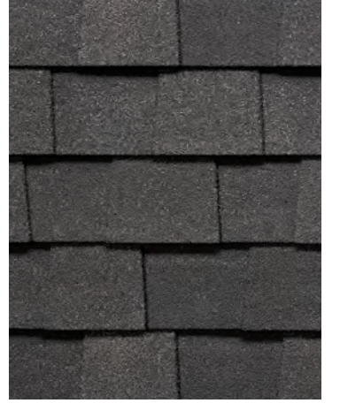
Max Def Pewterwood