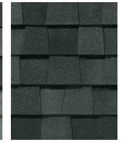
Max Def Moire Black